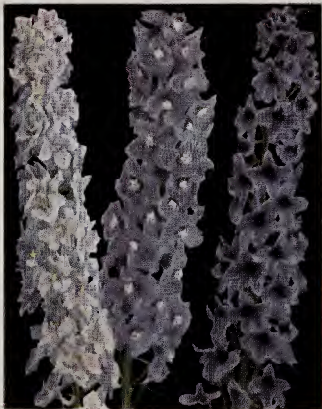
Burbank's First Prize Delphinium. 50 cts. each